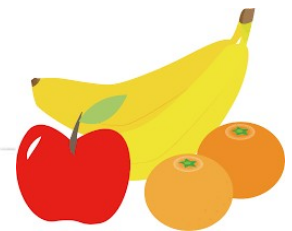
Our Favorite Fruit