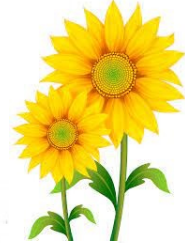
Our Favorite Flower