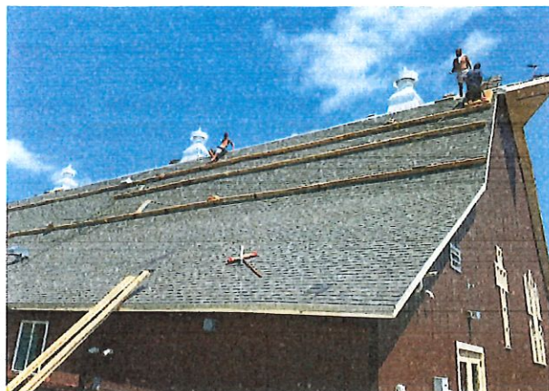
Reroofing the Chapel

While we've been apart due to COVID, the LuWiSoMo ministry team has been very busy working to improve camp and make it better than ever for when we can all return and gather again.